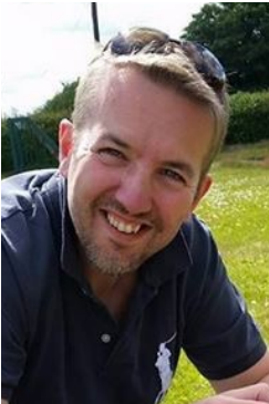
Martin Shorey Minister