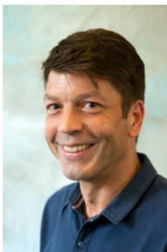
Andrew Jackson Worship